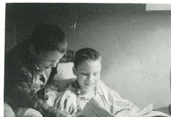
Taken with 3000 speed film alone